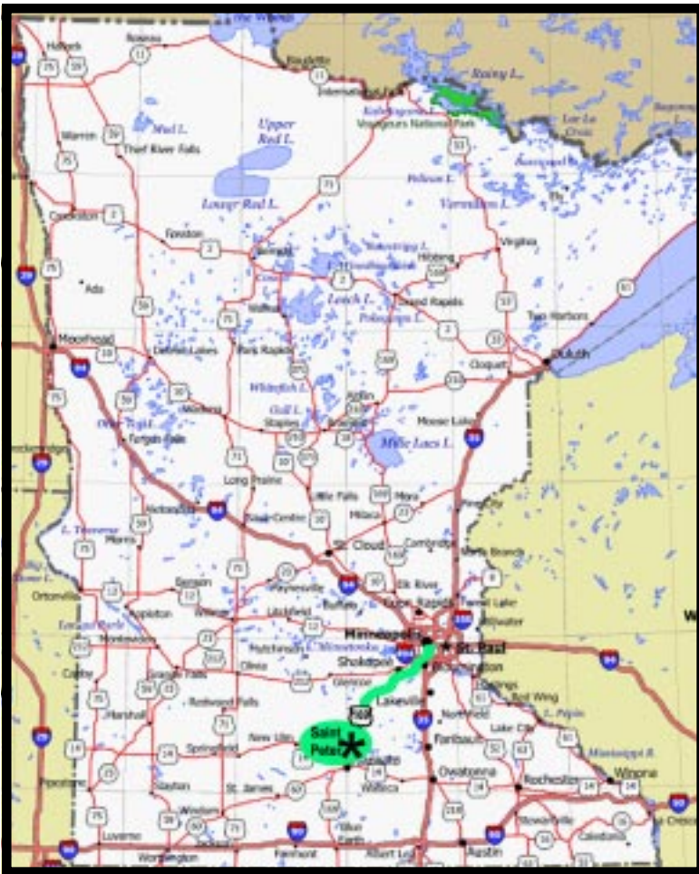
Saint Peter is 60 miles southwest of Minneapolis on Highway 169