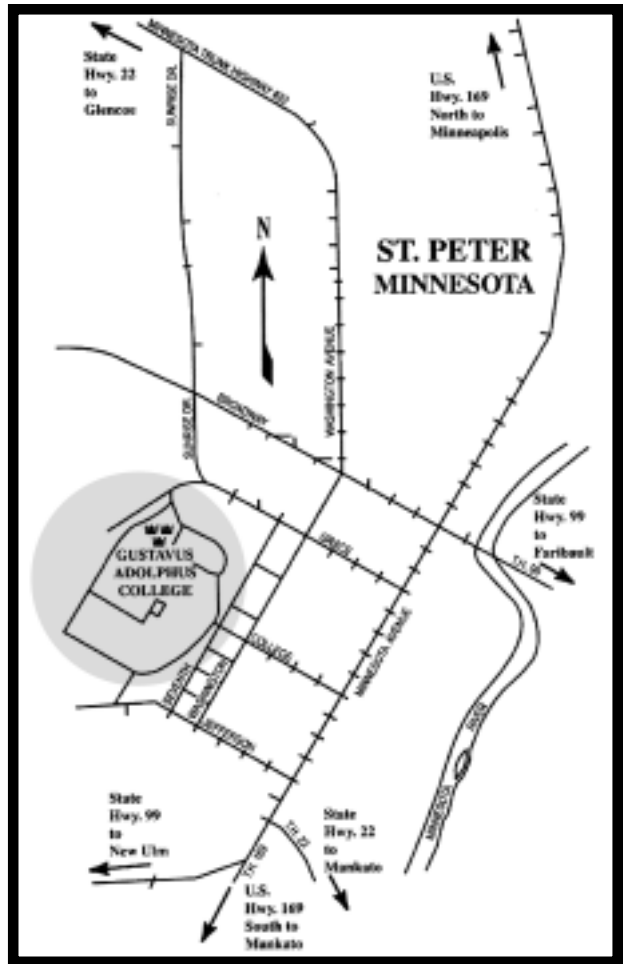
In St. Peter turn west on College Ave. to get to the Gustavus Campus.